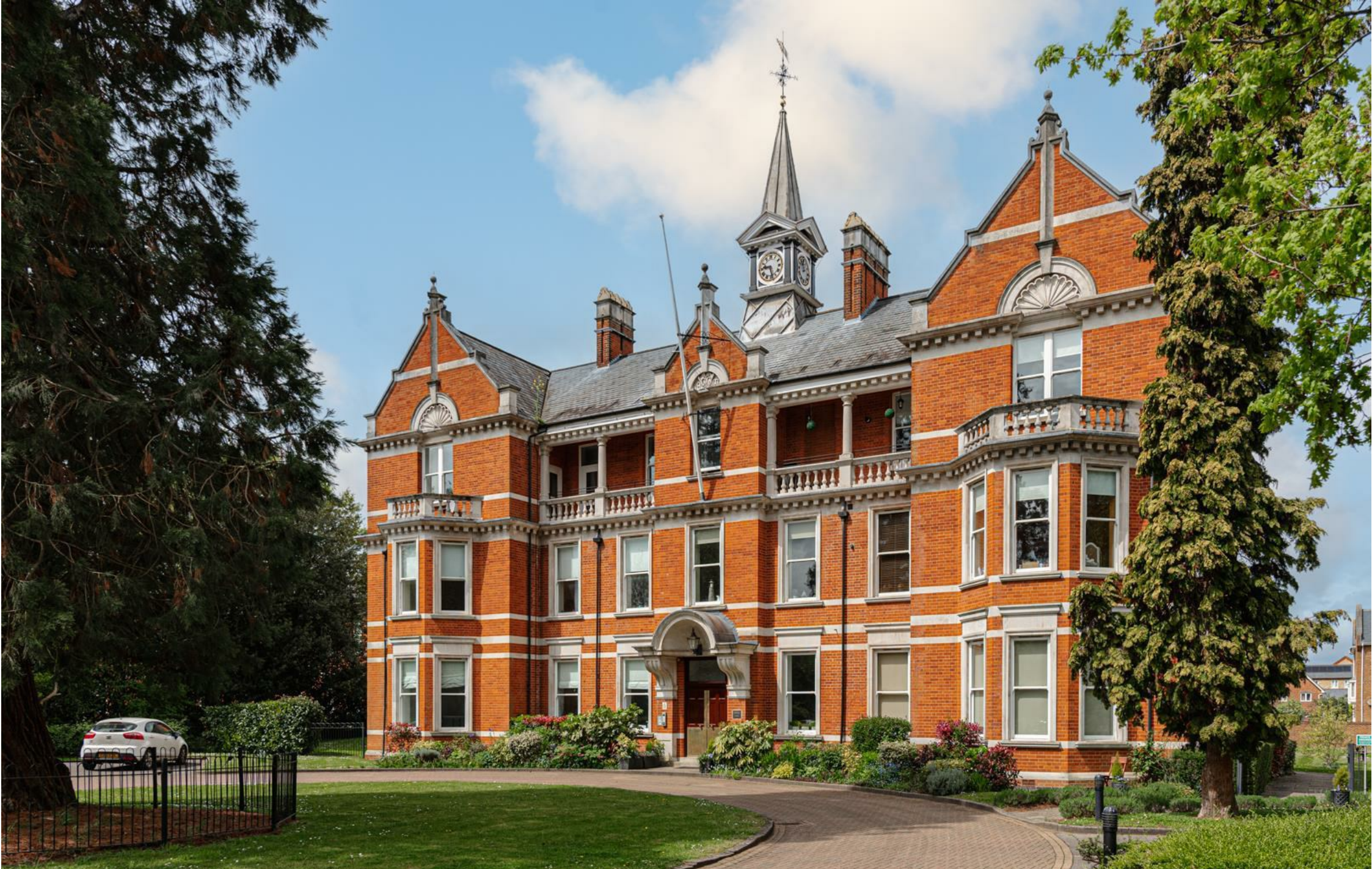
Prospect House, Epsom